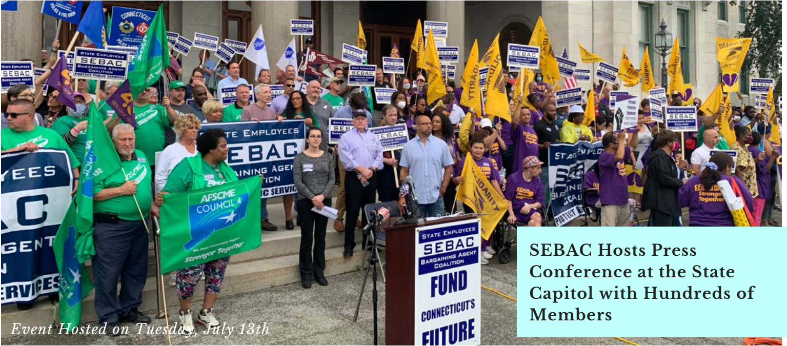
Event Hosted on Tuesday, July 13th

SEBAC Hosts Press Conference at the State Capitol with Hundreds of Members